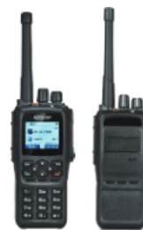
DP990/995 DMR PORTABLE RADIO

All specifications are tested according to applicable standards, and subject to change without notice due to continuous development. For more information, please visit www.kirisun.com or contact marketing.os@kirisun.com